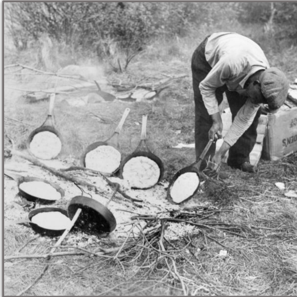
Photo credit: "First Nations person making bannock at Treaty payment, Lansdowne House, Ontario.", 1942, (CU190629) by Unknown. Courtesy of Glenbow Library and Archives Collection, Libraries and Cultural Resources Digital Collections, University of Calgary.

Many Indigenous people make bannock. This picture is from 1942.