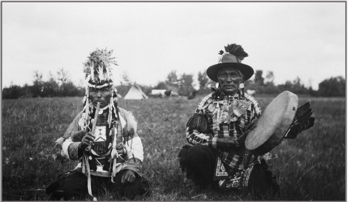
"Cree men, Meadow Lake, Saskatchewan.", 1926, (CU182400)

Drums have always been important in Indigenous culture. This picture is from 1926.