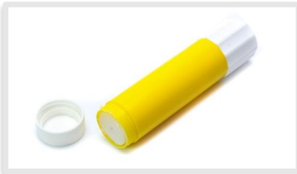
a glue stick