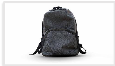
a school bag