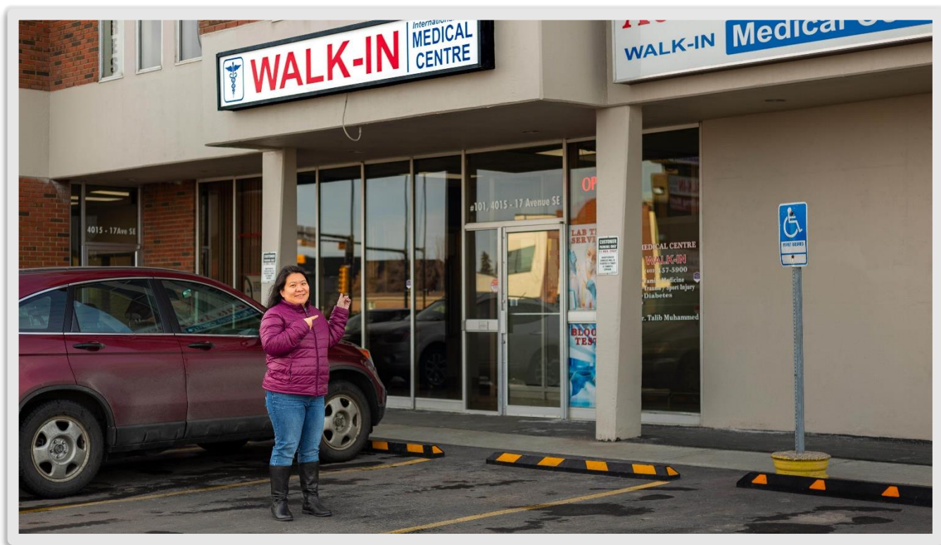
Anna gets to the clinic.